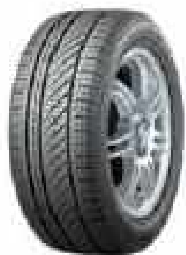
TURANZA Luxury Touring

Bridgestone is the market leading tyre company is recognised around the world for its products and services, which combine the very best in performance, safety and quality.