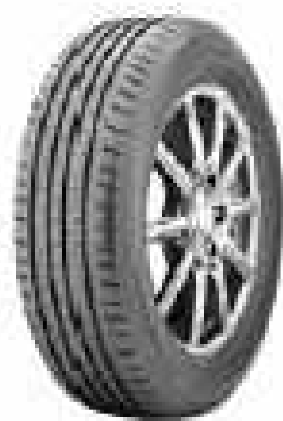
ECOPIA Fuel Saving