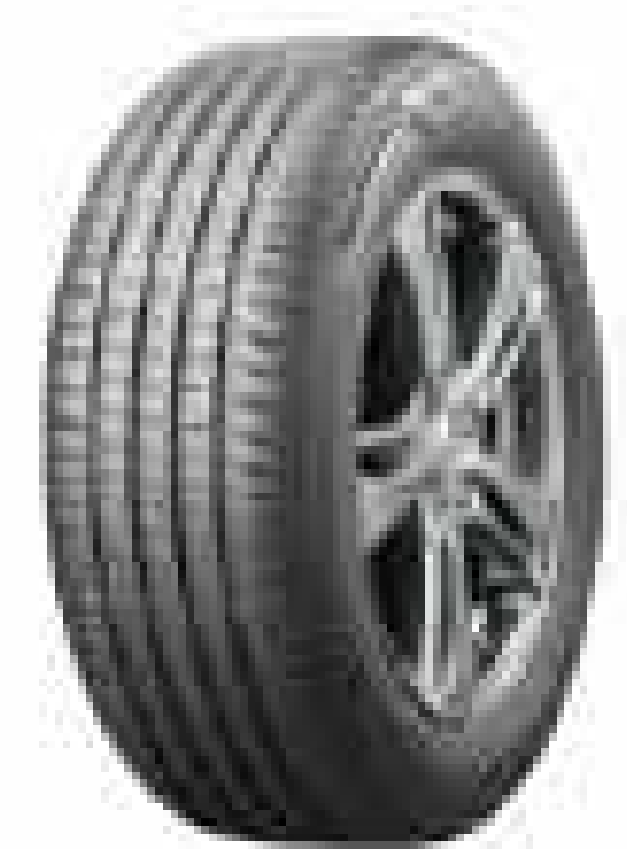
ALENZA Luxury SUV

We are proud official sponsors of the WRFL