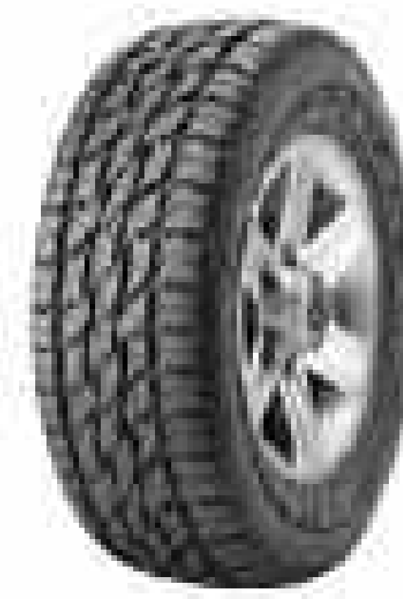
DUELER 4x4 and SUV